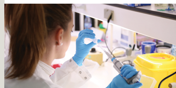
Innovation and research